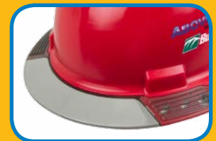
Grey Tint for shade