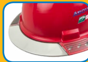
Clear Tint for full visibility