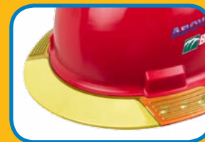
Yellow Tint to prevent glare