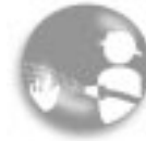
Fire and Rescue Safety